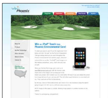
A landing page included details about the promotion and allowed users to register online.

This contest was heavily covered in the industry trade publications and it was promoted online and offline using print advertisements, e-blasts, online banner ads and tradeshow promotions.